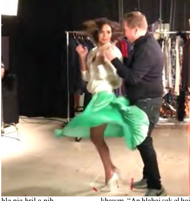
hla "Spice Up your Life" ti a hmang nia a ngai lein Mel B chu a lungawinaw hle a.

LOS ANGELES: The Spice Girls member hlui le ama puola fashion company Victoria Secret indin Victoria Beckham chu kum 40 chuongin nau pali a nei taa chu lam a la hnesaw hle a, a nuom chun zan sawt hnunga khawlai leng khawm a la thaw thei hle ti a suklang. James Corden a Late Show a Carpool Karaoke ah James leh zan sawt hnungin cara chuonga khawlai lengin an hla hluihai sakin dit-tawkin an lam a. Ennuom le hril a hlaw hle.