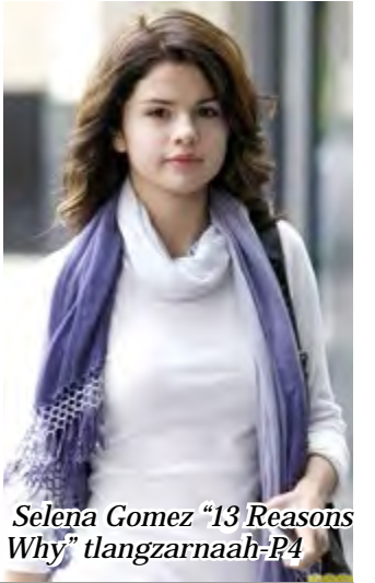
Selenia Gomez '13 Reasons Why' tlangzarnaah-P4

Regd. No. RNI - 40917/89 | Postal Regd. No. MNP - 67