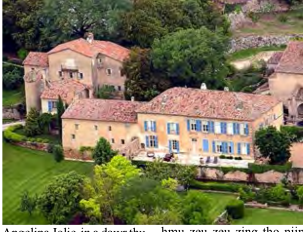
Angelina Jolie-in a dawr thu hi an hril a nih.

LOS ANGELES: Hollywood actress hausa tawn-taw, a pasal Brad Pitt leh inthe mek, UN Special Envoy ni bawb bakah nau paruk nu Angelina Jolie chun an sungkuo inthang lien pei umna dingin Los Angeles, Los Feliz laia in ropui deuh (mansion), USD $25 million man ding chu inchawk a lungril deu niin Page Six chun a hril.