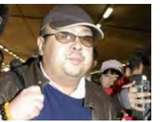
Kim Jong-Nam, brother of North Korean leader Kim Jong-Un.