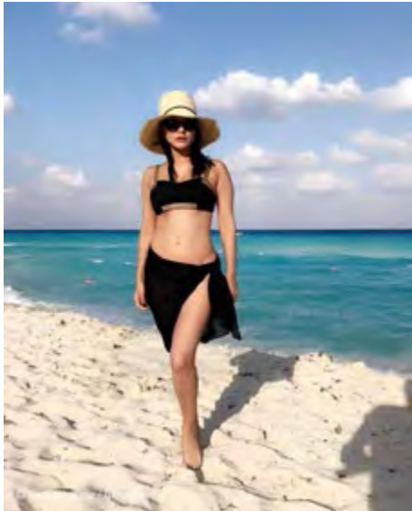
Sunny Leone in a black bikini on a beach.