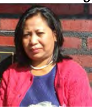
Chanchinbu chun a lawmpui hle.