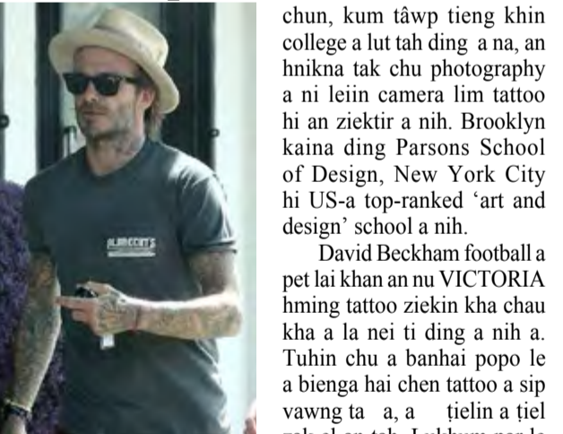
chun, kum tâwp tieng khin college a lut tah ding a na, an hnika tak chu photography a ni lein camera lim tattoo hi an ziektir a nih. Brooklyn kaina ding Parsons School of Design, New York City hi US-a top-ranked 'art and design' school a nih.

LONDON: Celebrity pawisa hau taluo thaw ding le pawisa hmang dan hre nawhai, inhawi an ti zâwng le Pathienni an hmang dan khawm an ang naw thei hle. Thenkhatin thlarau them phâk lo sakhuo thil Sciencology dang an inhnika pawisa tam tak an sêng (Tom Cruise, etc). Thenkhat titak zeta Biekin an kai lai, David Beckham le a naupa Brooklyn ruok chun taksa ziekrang tattoo an lo hlimpui ve hle.