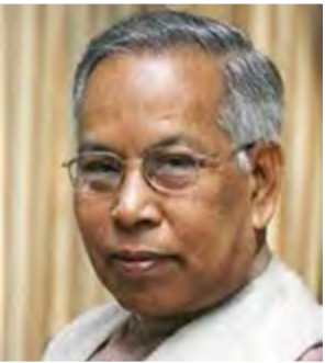
pe ding in a phut.

NEW DELHI: Zanikhan Lok Sabha –a chun Zero hour hunah Cognress MP Thokchom Meinya chun sawrka thlungpui le NSCN(IM) in Framework Agreeement an ziek chungthuah Prime Minister Narendra Modi chu a ni dan chiong taka hrlifena (statement)