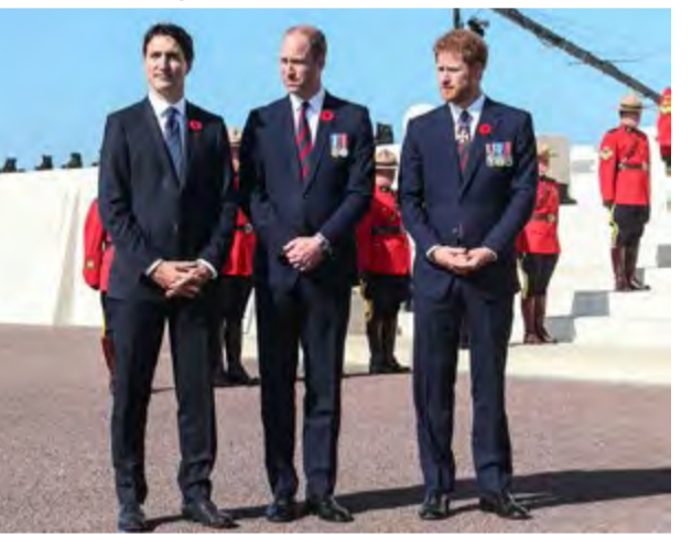
April thla bul lai chau a la nia chu William le Harry hi official engagement tamtak an nei hman tah a nih.