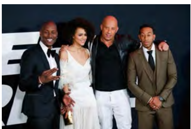
bâka hin off screen thu, a changtu ve ve Vin Diesel le Dwayne Johnson hai kâra inhrietthem nâwna um anga hril rikin a sukhuoi pha baw niin an hril. Asan chu "Fast and Furious" chu sângkuo inthuruol tak chanchin a ni lein inthuruol nâwna uma hril hin burok a suksiet a nih.

LOS ANGELES: "Fast and Furious" serial a tawpnatak dinga hril tah "The Fate of The Furious" chun ni hni sung chauvin China territory ah $135 million a lam suok hman a nih. "Fast and Furious" series a chu "Furious 7" dawtah sum hui lut rawntak dawt a nih tah. "Furious 7" kha $147.2 million a hmu suok hman a nih.