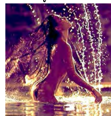
Jylie Jenner (19) hai an nih. An nu Kris Jenner chun Instagram ah a nauu upatak chu, "Happy birthday beautiful @kourtneykardash!! I pieng nia inthawkhin hlimna nasatak i mi pek a nih. Hlimna le lawmna, hmangainahai i mi pek a, kei le mi dang tamtak kuomah. Nu, unauu, ruoltha le nau thatak i ninahai, thuin a hril sêng lo hmangainan ka hmangai che, sungtieng le puotieng i tha vawng, ka naute. Ni inhawitak hmang rawh, Mommy #love #family #grateful #happybirthdaykourtney" tiin a post a. Zana a birthday hi ropuitaka la lâwm an tum a nih.

LOS ANGELES: Nau pathum nei tain kum 38 a tling taa chu reality TV star le "Keeping Up With the Kardashians" star Kourtney Kardashian chun a piengchampha le inzawmin a pieng laia umdân (sarook) ang chara a puittling hunga a thlâlak "Birthday Suit" tia a ko chu Instagram-a a hnung zuit 56 million hai a share a, a nal bawka an dit tâw hle.