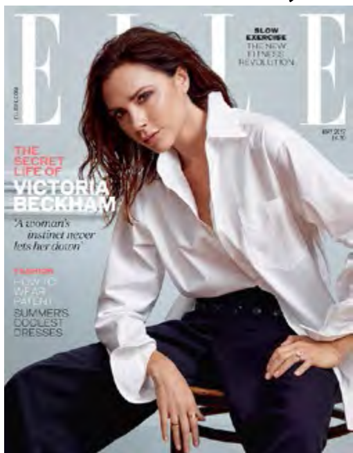
Victoria Beckham hin ruol a pawl nguntak chu an thlai suongtu chef Gordon nuhmei Tana Ramsey a nih a. Spice Girls-a a ruolhai Mel C le Emma Bunton an nih baw. Zani khan kum 43 a tling

LOS ANGELES: David Beckham a nuhmei, The Spice Girls band-a khawm ze ngui pawl, tuta fashion designer inlârtak le hausatak ni tah Victoria Beckham chun ruol a pawl tam bek nawa chu a hmangaitakhai kawlah a um zing lein ruol a ngai hran chuong naw niin a hril. Elle magazine cover-a dinga hmang a nina le inzawmin, "Ruol ka hau nawa chu mi ka pawl nuom le ka umpui nuom indiktakhai leh kan inpawl hlaka. Ka khua a sâwt ngai nawh" tiin a hril.