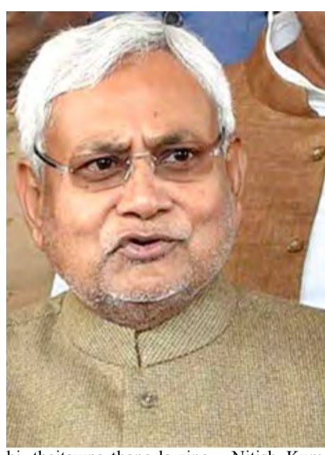
hi theitawpa thang la zing a nih. Congress hi Bihar-a

NEW DELHI: Bihar Chief Minister le Janata Dal (United) thuoitu Nitish Kumar chun zanikhan Congress President Ms Sonia Gandhi chu New Delhi-a a chengna inah an hmupui. Hi huna hin tulaia ei ram political ngirhmun an hritlang niin ei thu dawngna chun a hril.