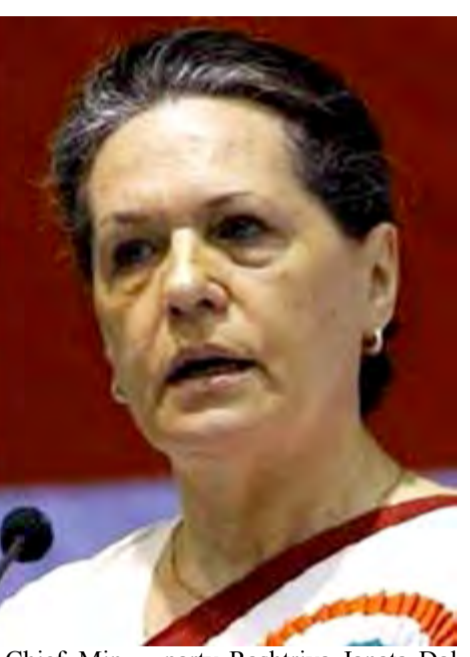
Nitish Kumar Chief Minister nina hnuoia Janata Dal-United le Lalu Yadav party Rashtriya Janata Dal sawrkara thang ve a nih. Hieng party pathum hai hin