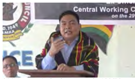
33/11 KV 3 sin thawna zo le 132/33 KV si thawna a fe mek thu, Sinzawl le Thanlon PHC sie a ni ta thu, CHC a dawmsang a ni theina dinga hma lak mek a ni thu hai a hri.