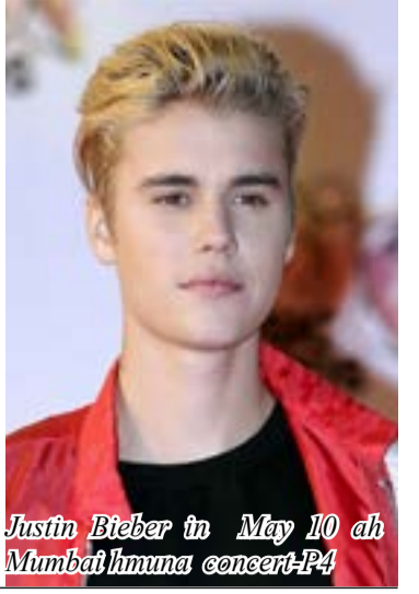
Justin Bieber in May 10 at Mumbai huna concert P4

( A N I N D E P E N D E N T D A I L Y N E W S P A P E R ) Regd. No. RNI - 40917/89 | Postal Regd. No. MNP - 67