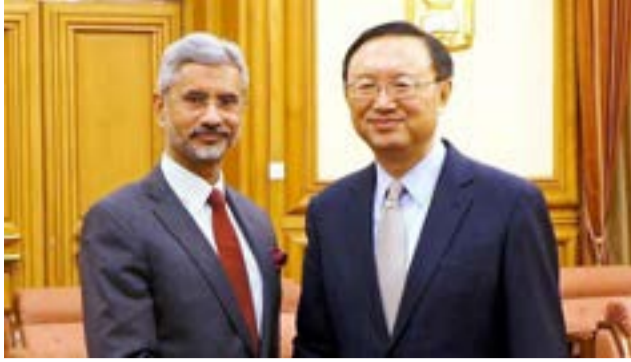
Wang Kang le China in rambung pahni hai inzwamna sukdetna dingin a hmasatamna dingin dilsut taka hohlim tlangna an nei. Inbiek tanna dingin, Foreign Secretary S. Jaishankar chun India le China chu kum tam tak liemtah a inthawk inlaichinna an nei chu a a zaia hma sawn tung pei thu a hril a, India chun inlaichinna sukdet pawimaw a ti thu a hril.

India le China hai inzwamna chun a rambung pahni hai le khawvel pum huop tading khawma ngawng a nei ding thu a hril baw.