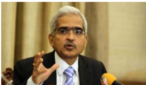
NEW DELHI: Sawrkar thlungpuiin Rs. 1,000 note suksuok tumna a nei naw

tak siem suok ani thu Economic Affairs Secretary, Shaktikanta Das in a hril.