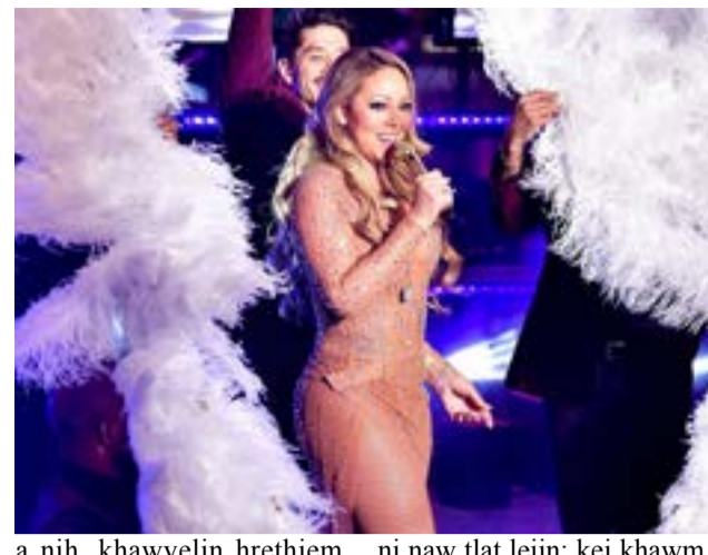
a nih, khawvelin hrethiem chuong naw ni hai, an sin a ni naw tlat lein; kei khawm dawkana sinthaw ka thei naw

LOS ANGELES: "Obsessed" singer le ama puola TV show "Mariah World" host-tu Mariah Carey chun New Year zantienga Dick Clark's New Year's Rockin' Eve With Ryan Seacrest, New York-a a chet fuk nawnu thua khan, "Thil a buoi vawnga, mi po po ka dem vawng" tiin Rolling Stone magazine le interview an neina ah a hril a. "Rehearsal zoa ka fe nghanaw khawm kha kei le kei kan dem a nih" tiin a hril baw.