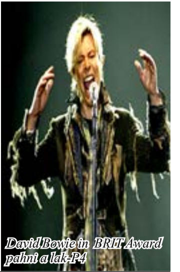
David Bowie in BRIT Award palm at lak-P4

Regd. No. RNI - 40917/89 | Postal Regd. No. MNP - 67