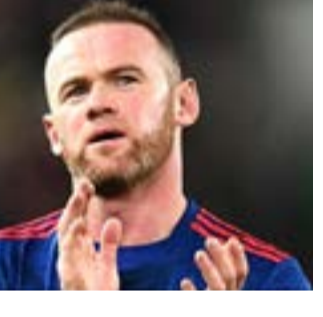
England captain hi kha hma laia inthawkt kha Chinese Super Leaguea inkhel dingin beisei a lo ni rawp taa, chulaizing chun tu club am a pan ding khawm hrilfienaa aum chunguonawh. Beijing Guoan club chu hrilrik takin um sien khawm BBC tienga chanchin lakkhawmtu hai chun hi club hin an beisei bek naw tu an hril. Overseas player laka dan thar aum leiin Jiangsu Suning le Tianjin Quanjian club hai pahni chu a khan taka nag a nih. Chulaizingchun Tianjin Quanjian thuoituhai le Rooney agent hai inbiokpawna lo nei hai sien khawm sunzawmna aum chunguonawh tu hril a ni bawk. Thawleni khan Mourinho chun insukpal leia hung kir chau Rooney hi week matcha hai Old Trafford-ah a um zing thei ding le dingnaw a hril thei naw thu hrilna a nei. Thu fe dan enin hung tlong ding Pahtienia EFL Final match Southampton hai le an inkhel ding khawm khin Rooney hin hmu a chang chi di m tuchen hin chieng takin hril theina a la um nawh.