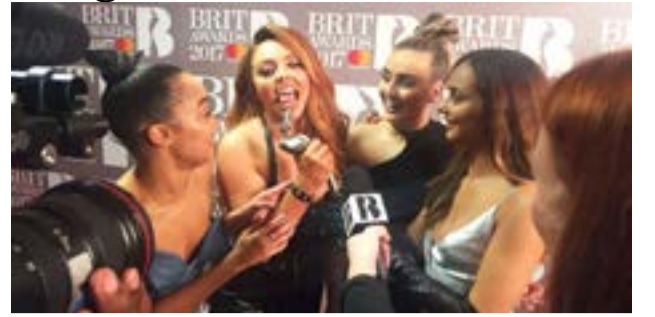
award dawng inring lo la an nih. Result an puong lai hin a hung tieng an um leini an hung suok intak taluo a, an hla hi anni ngahkain vel hni zet an lo play a nih. Best video for History chu One Direction in an lak a, Liam Payne chun lawmman an dawng el hi chu mak a ti hle niin a hril. “Kum tamtak kan châwl ta hnunga award kan la dawng hi chu a mak a nih” tiin a hril. “Wham! Member hlui pahni han George Michael tribute an pek a, ama hrietzingna dingin Pepsi le

LONDON: British hla-sakthiemhai chawimawina insangtak Brit Award 2017 ni pui ni tak chu O2 Arena London ah zani khan ropui taka nei a nih a. A hun hawngna dingin nuhmei ruol band “Little Mix” hai chun an hla mawitak “Shout Out to My Ex” ti an hung sak a, mit le na suktlai hle.