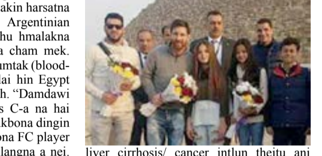
Hepatitis C natna hin khawvel mihriem 130 – 150 vel nun a sukbuoi taa, hi natna hi sukdam ani naw chun thina annawleh liver cirrhosis/ cancer intlung theitu ani bawk a nih. World Health Organization in a sui dan chun kumtin hepatitis natna leiin 500,000 chuonging thina an tuok nia hril ani bawk. Messi hin Tour n’ Cure ambassador ni dingin suoi keina lo nei tain, December thlath Egypta inzindin ding ti chu suicide bomber han Cairo biekin an bomb leia mi 29 zetina thina an tuok lei khan inzindin lo a um a nih.

North Africa rambung haia Hepatitis C natna an leng nasat leia mi tam takin hasratna an tuok hai sukrena dingin Argentinian football star Lionel Messi chu hmalakna sukhtrat dingin Egypt rama a cham mek. Hepitis C natna hri hi natna tiumtak (blood-borne viral disease) niin, tulai hin Egypt rama hin an leng nasa hle a nih. “Damdawi tha taka ei pek chun hypitiss C-a na hai khawm eila san thei, hi thil sukbona dingin hma la ng ei tiu,” tiin Barcelona FC player hin a Facebook page-ah zieklangna a nei. Egyptian initiatives hai chun hi programme hi khawvel po poa hepatitis invawihai ta dinga buotsaita a nia, hi hmalakna thang hai chun Egypt ram mawizie hai enna hun le a rothil hai ena hun nei an ta, chu zoa ni nga sung 5-star hotelah hung chawhadam a tih,” tiin a hril.