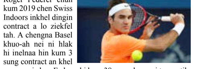
Federer hin kum 1998 khan a vawu khatna dingin Swiss Indoors an khel a, khang hun lai kum kum 17 chauh upa niin Andre Agassi lakah straight set in lo tlawm lemin, hi hungra hin wavi 7 zet a lo champion ve ta a, kum 2015 khan a champion nuhnung takna niin final-ah Nadal a hneban a nih. A kum tam ta leiin, inkhelna po po haia inlang taloa um a niin, Australian Open hnungah kha inkhelna dang ala hmasat thak naw a, kar thara Dubai Duty Free Championships um dinga khin an lang ani chun Australian Open zoa an lang nawkna hmasatak ning a nih.

Roger Federer chun kum 2019 chen Swiss Indoors inkhel dingin contract a lo ziekfel tah. A chengna Basel khuo-ah nei ni hlak hi inelnaa hin kum 3 sung contract an khet zawm ani chun Federer hi kum 38-a upa hung ni tang a tih. Kum 35-a upa Federer hi nikum khan hliemna tuok leiin season tawp tieng chau an khel hmana, tukuma ding tournament hmasatak Australian Open-a inlangin, final match-ah Rafael Nadal hnein a vawu 18na dingin Grand Slam nopui a chawi a nih. Federer chun, “Basel-a inkhel hi kum tina ka thil tum le ngai pawimawt ak ani hlak,” tiin a hril. Federer hin hliemna a nei ani khawmin inkhelna liena hai player langsarhai hne theina dingin abeiseina le atumruna hai an hnuol ngainaw thu a hril bawk.