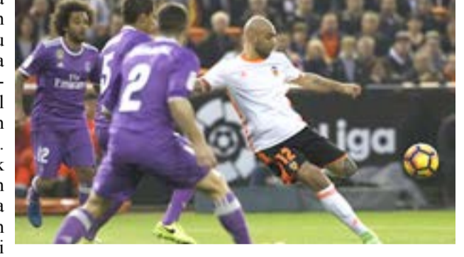
Inkhel sung po po Real Madrid chun Field-ah ro an rel a, ball khawm an changrawn hle. Valencia tiengin 32% chau an chang pháik a, Real Madrid chun 68% an chang ve thung. Valencia goal vengtu a sawl hle a, anachu goal an suo tlawm leiin hratna an chang lem a nih. Tu hin Real Madrid hai hi Barcelona neka vavikhat inkhel tlawm lem point 52 an nei a, pakhatna an la ni zing. Barcelona hai chun point 51 neiin a dawttu an nih mek. Chuh, Valencia hai chu table-ah a 14-na an ni ve thung bawk. Hi inkhela hin Valencia tiengin Yellow Card panga tawp an hmu a, Real Madrid tiengin pahni an hmu bawk.

Spanish Premier League-La Liga kar lailung inkhelah Leader Real Madrid chu Valencia khelmuolah an va mikhuol a, super star Cristiano Ronaldo chun goal pakhat thun sien khawm hratna a changpui zo nawh. Inkhel tan a nia inthawkt minute 10 khawm a liem hma n muolpui Valencia chun Simone Zaza le Fabian Orellana hmangin goal hni an zuk thun nghan a. Mikhuol tieng Real Madrid khawmin theitawpin an goal bat chu thung lét tumin thang an lak a, half hma charin Ronaldo chun goal khat a thun a, beiseina a hung suksang met a chu hun tawp chenah goal dang an thunsa ta naw leiin point pakhat khawm hlaw dawkt lovin Real Madrid chun an tlawm lem ta a nih.