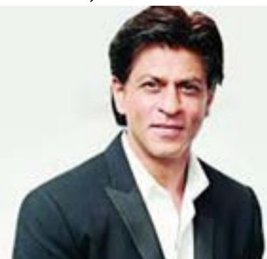
hai an nih.

MUMBAI: Kum thar 2017 hin a film thar tak "Raees" tlangzar dinga aningsat zing laiin Shah Rukh Khan chu 2016 kuma film star social media Twitter-a zawng hlaw tak, a hming sam rawntak a nih. Shah Rukh Khan hin a ruolpa Salman Khan a khum a nih. An account a inthawka an activity le followers han an zui dana inthawka inkhiin Shah Rukh Khan-in 36% a hmu a, Salman Khan chun 18% a hmu.