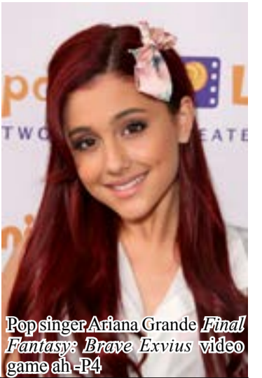
Pop singer Ariana Grande Final Fantasy Brave Exvius video game ad - P4

Regd. No. RNI - 40917/89 | Postal Regd. No. MNP - 67