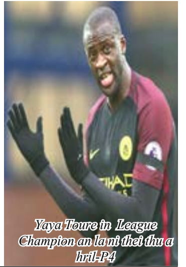
Yaya Toure in League Champion an la ni thei thu a hrii-P4

Regd. No. RNI - 40917/89 | Postal Regd. No. MNP - 67