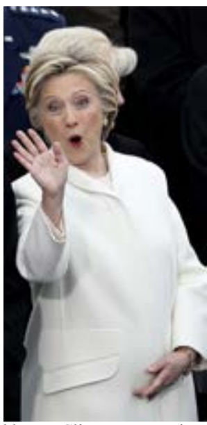
khawm Clinton a campaign, debate le meeting haia hak ding zakuo (thuom) iengkim design-tu a nih a. Trump khawmin a nuhmei incheina

Washington: Khawve-la rambung hrattak le thilthawtheitak America rorela kháwl cheltu nuhmei a hmasatak ni tuma theitawpa Donald Trump a beia a hne naw hnungin polite takin hneban a ni thu a pawm a, America mi indiktak a nina suklagna dingin a khingpuipa láwmlutna hunah American mi ngei thui zakuo hákin American takin President lawmlutna hunser ah a thang a, mipui láwm a hláw hle. Hillary zakuo hak le kekawr bun, class nei tak "pansuit" var (coat le kekawr) le pheikhawk inhmeipi tawk hi American designer Ralph Lauren design a nih. Ralph Lauren hi Presidential election lai