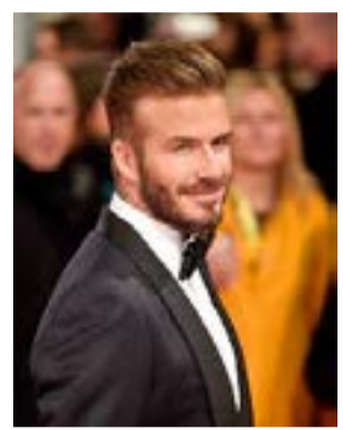
lai hun thu hril a ta, Richard Dimbleby'n Hitler a thi laia a chéngna hmum va entu Journalist hai laia pakhat a nina angin Hitler a chemta lak chanchin hril a tih. David Beckham chun a hringnuna thil pawimaw deuva a hriet, danglam deu hlek a nuom tak hril véng a ta, chubakah Presenter-in a nuom nuom an dawn ding a nih.