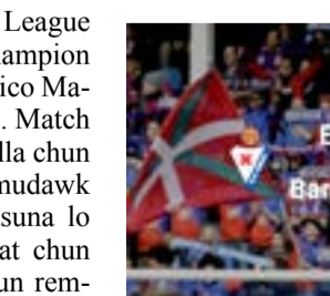
Chun hnungah Real Betis chun Relegation Zone-a lan tang mek Sporting Gijon hai lo mikhuol ve thung an tih. Sporting Gijon hin an lo thaw tha hle a an hrat lem pal a ni khawma relegation zone suoksan phak chuong naw ni hai a, Real Betis ruok chu an hrat lem vai chun 15-naa inthawkin Top 10 inhlangkai thei ngirhmuuna ngir an ni ve thung. Copa Del Rey Quarter Final-a Real Madrid hne zo chau Celta Vigo

Vawizan Spanish Premier League inkhel sunzawm ning a ta, champion thei ding thal Barcelona, Atletico Madrid le Sevilla hai thang an tih. Match hmasaah pahinna ni mek Sevilla chun game 18-a point 9 chau humdawke le table mawngphaa um Osasuna lo mikhuol an tih, Sevilla an hrat chun pakhatna inhlangkai theina hun remchang tak a nih (Zani zan khaan pakhatna Real Madrid an khel a, an hrat le hrat naw ei hriet hman ta nawh). Match dangah Athletic Bilbao le Atletico Madrid hai inhmasoon ve thung an tih. Tuhin Atletico Madrid hai hi palina an ni mek a, an lo hrat lem a ni khawma an dinhmum pangngaia bawka la um an tih asanchu Barcelona hai nekin point 4 tawpin an inhnuoi lem lei a nih. Athletic Bilbao ruok chu a pasarina an ni mek a, an hrat lem khawma an dinhmum