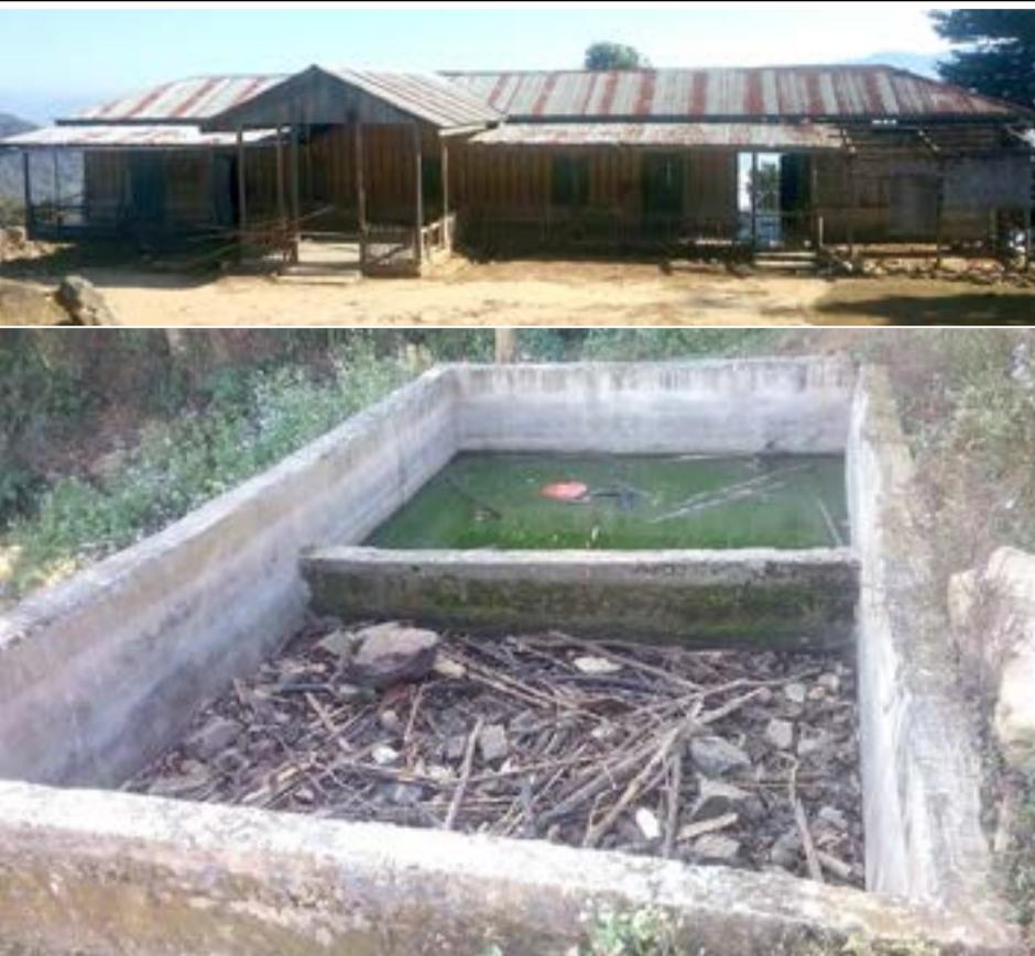
Manipur sawrkarin District thar 7 a puong laia Pherzawl district sunga school building le a bul ela um Septic tank ding ni awm taka siem hman lo le tawp takin a um. Htiengang failed infrastructure hi tam tak hmu ding niin a hmuna zu fe han an hril.