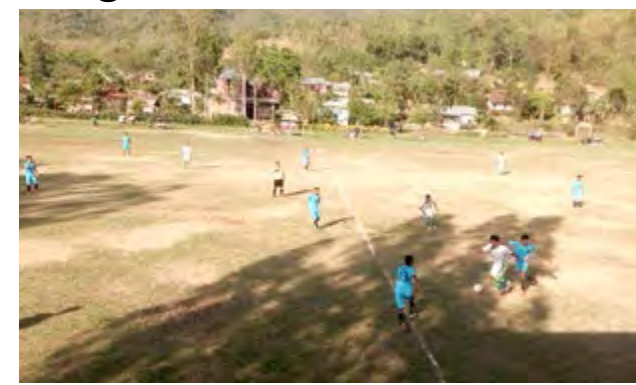
5-2 tawpin hnena an chang Anni Pool-a pakhatna chu a, an pool-ah pahniina niin HYA Imphal an ni a, anni knockout an inhlangkai. hin group game pathumah

State Level Hmar Martyrs' Rolling Trophy a vawi 14-na fe mekah zani khan Group match tawpna inkhel pahni a um a. A hmasa lemah Pool E-a um Zeal SC le Thangzalian Memorial Team(TMT) an inkhel a. TMT hi hrat khawma knockout kai phak chungo ta lo hnung an in a, Zeal SC ruok chu draw khawma kai thei ngirhmuna ngir sa an nih. Mi tam lem ring ang ngeiin Zeal SC chun