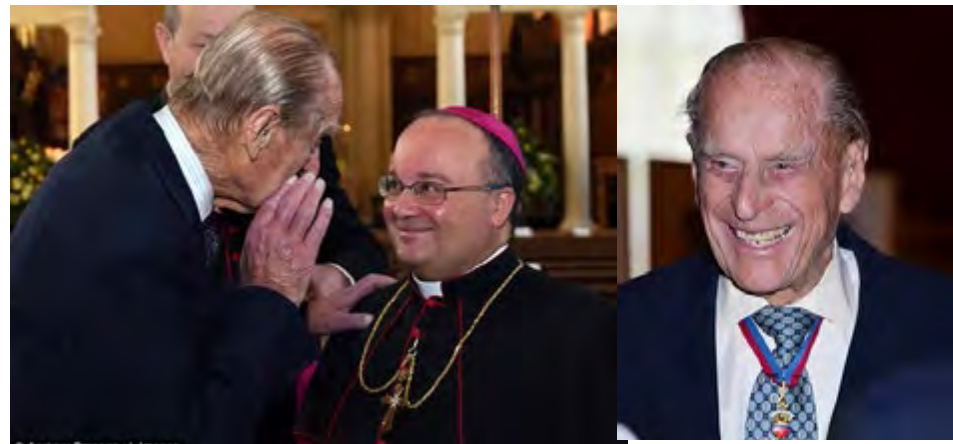
nuiat um an lak khawm laia mi tlawmte hei tarlang ei ti h.

Lalnu leh an fena thang lovin, 1947 a inthawka a minimal Royal engagement a nei zat chu 22, 000 a ni a, wavi 5, 000 thu a hril bawkr. Philip hi fiemthu thaw zau a hrat em em a. An insung le an inzinna ram tina a thuhiril