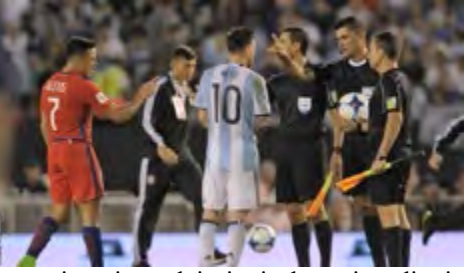
mawi a ninaw lai zingin ban zing dingin evidence a tha tawkr naw a nih tiin a hril.

Ban hlip a nita lei hin Uruguay, Venezuela le Peru hai le inkhel huna a thang thei ta ding a nih. Ban hlip a ni le inruol hin 10,000 Swiss francs (£7,800) fine dinga ti khawm phlip ngah a nih.