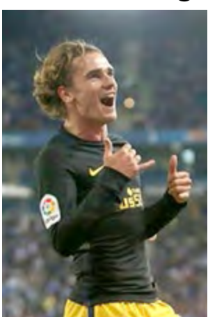
Griezmann a lak thei chun a thiltum hi iemani chena a thangpui ngei a ring bawkr.