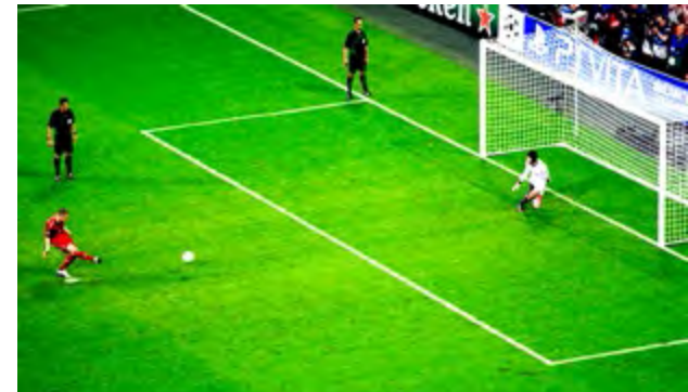
lema uma ngai an nih.

Dan hmang lai hi sawiswela ne a lai tawknaw a ngai ani lein suizuina nei a ni a, suizuina a inthawkr chun penalty pet hmasa team hai chun 60% zetin hratna an chang hlak hmu-suok a ni lein ngirhmun tha