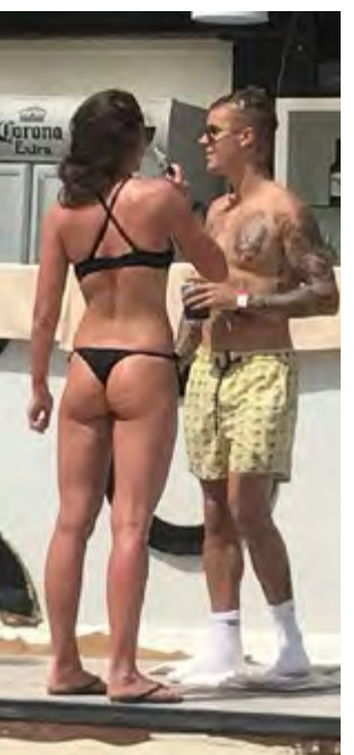
lungkhor lai tak Cross lim a ziek bawk, a pumin a rang nei nuoi el a nih.

DUBAI: Canadian lantangval malzai thiem le lung inrawm leia thubuoi hau em em Justin Bieber chu a world tour fe mek le inzawmin Inrinni khan Dubai ah mi tamtak insukdeina hmuna ama khawm nunghak pakhat leh an insukdei a, innel taka an inbiel le an inhnel lai hmu a nih a. Nunghaknu hi tu'm ti ruok chu hriet a ni nawh. Kum 23 chauva upa millionaire singer hi a hlim em em a. Kekawr bul chau bunin a taksa a ziekrang tooo tamtakhai khawm langchang taka hmu thei vavng a nih. Tuipui kamah nunghak zakuohnuoi (bikini) dum chau hak pakhat leh cold drink an dawn a. A lum leia zakuo bova Kekawr bul bun siin mawza var, pheikhaw boin a buna, sunglass leh inhaw a ti hle.