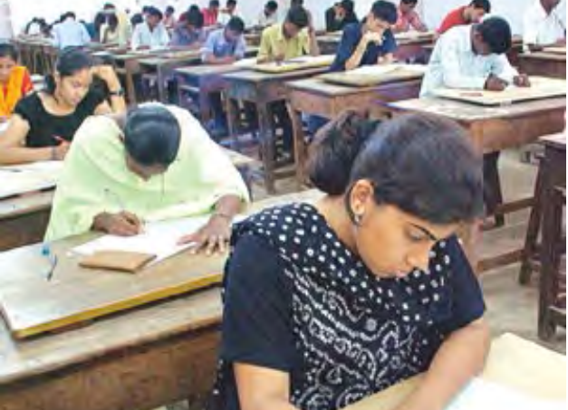
97.17% le 96.67% hmuin pahinna le pathumna an nih.

KOHIMA: The Nagaland Board of School Education (NBSE) chun zanikhan High School Leaving Certificate Examination (HSLC) le Higher Secondary School Leaving Certificate Examination (HSSLC) 2017 result a puong.