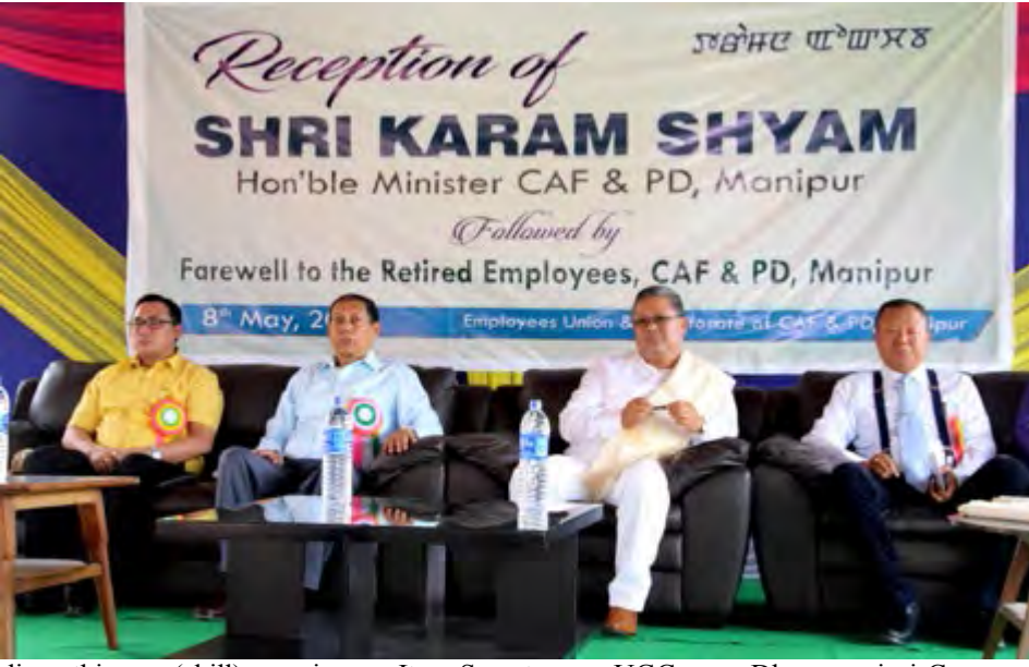
dinga thiemna (skill) an nei a pawimaw tah a nih tiin a hril bawh.