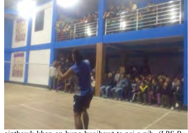
ainthawk khan an hung huoihawt ta pei a nih.