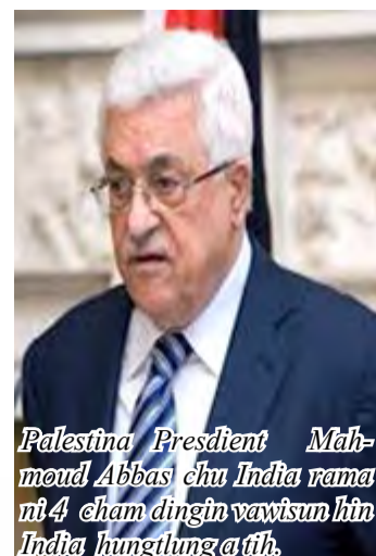
Palestina President Mahmoud Abbas chu India rama ni 4 cham dinghin vawisun hin India hunglunga tih.

Regd. No. RNI - 40917/89 | Postal Regd. No. MNP - 67