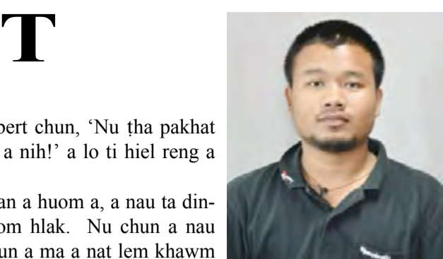
12 May 2017 | Guwahati