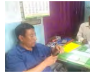
IMPHAL: Forest Check Post, Mantripukhri, Imphal West chun Toll tax pe lo

le dan kala Lung le phaiphin phur Trucks 10 an man tiin Forest & Environment Minister Th. Shyamkumar chun a hril. Minister hin zanikhan Forest Check Post, Sekmai le Kanglembi, Imphal West District hai a va sir.