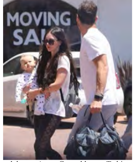
zak kep a. An pa Green khawm T-shirt var le kekawr bul le Sneaker dum a bun a. Bag le thuumhnawhai a khai a. Kum