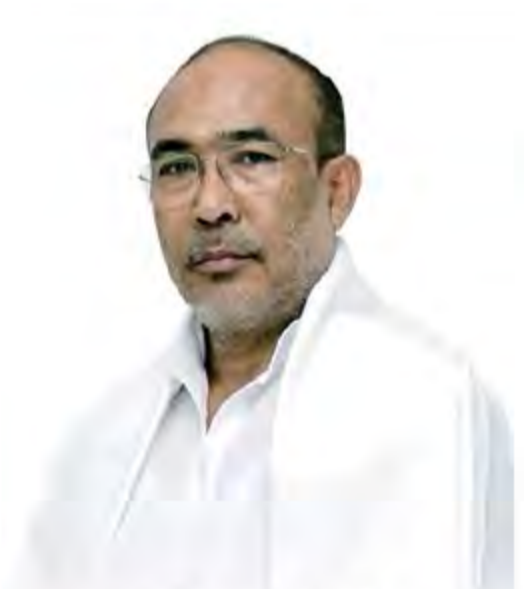
N. Biren Singh Chief Minister