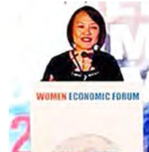
Mizo society sunga women empowerment le gender equality tiengpanga hma nasa taka latu a nih.