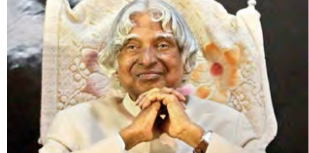
LOS ANGELES: NASA Scientist hai chun, NASA hnuoia laboratory pakhat Jet Propulsion Laboratory

(JPL) a researchers han International Space station (ISS) filter-a bacteria pakhat an hmuok thar chu India President hlui le missile man tia ko hiel fam tah Dr A.P.J. Abdul chawimawina dingin a hmingah Solibacillus kalamii ti an inbuk.