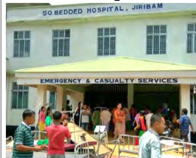
JIRIBAM: District Hospital, Jiribam-ah specialist Doctors, Doctors, Nurses le staff dang dang huntawk sie