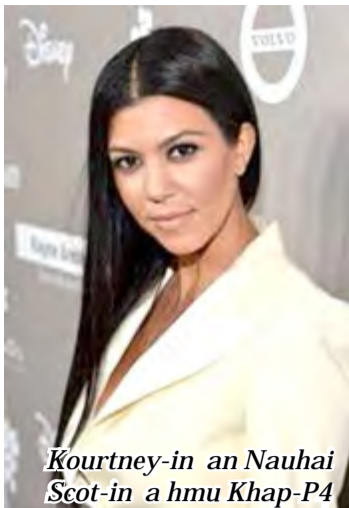
Kourtney-in an Nauhai Scot-in a hmu Khap-P4