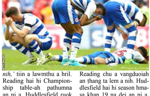
Table-a insang lem

Thawtanni zan khan England Championship Club hai premier league promotion play-off final Huddlesfield Town le Reading an inkhel a. Hi inkhela hin inkhel hun pangngai le hun belsa ( minute 120 sung ) goal thun bik um lovin an inhnetaw a, Huddlesfield Town chun Penalty-in Reading hai 4-3 a hnein kum 1972 a inthawka a hmasa takna dingin Premier League an inhlangkai. Huddlesfield Manager Wagner chun, " Ka hlim bek bek a nih, ka player hai chungah khawm ka lawm bek bek a nih, chubakah hi club le inzawmna nei taphawthai chungah ka lawm hle a